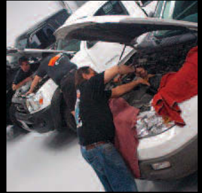
Test Fitting Department