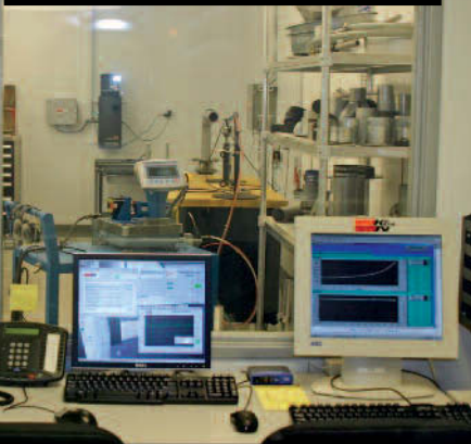
ISO-5011 Filtration Test Lab