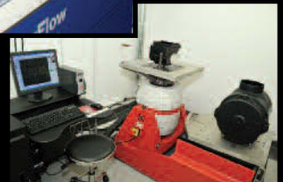
Vibration Testing Lab