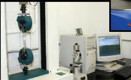
Tensile Strength Test Lab